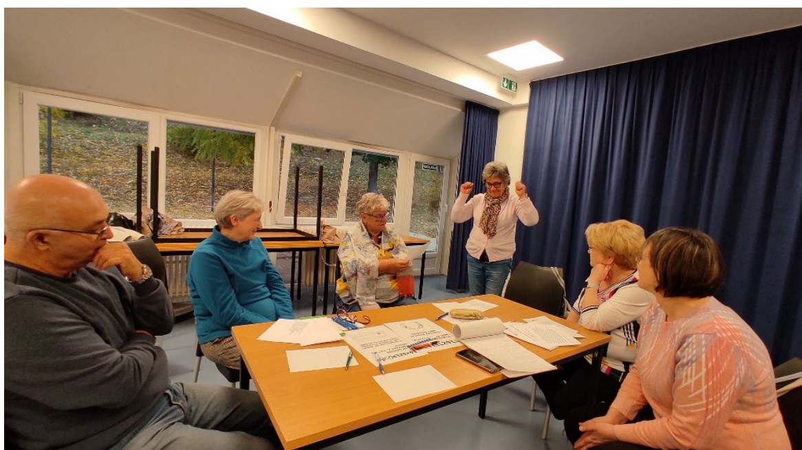
Special form of cooperation: one is reading a text, the other is showing it's contents by movement

One of the facilitators of the Komló group is the designer and caretaker of our Facebook website. On WVD i.e. 16 October and on the subsequent days she daily posted a value on the FB page of our association, together with a picture and motto.