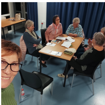
What is flexibility?