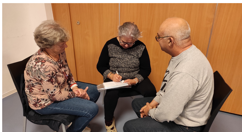
How to apply it to get to the future?