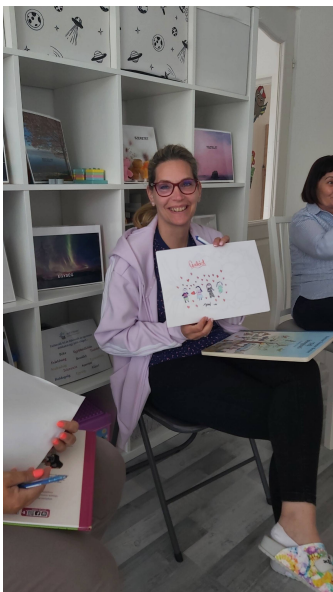
Meaning of Family