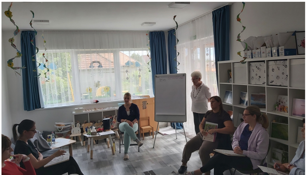
Some participants and the facilitators