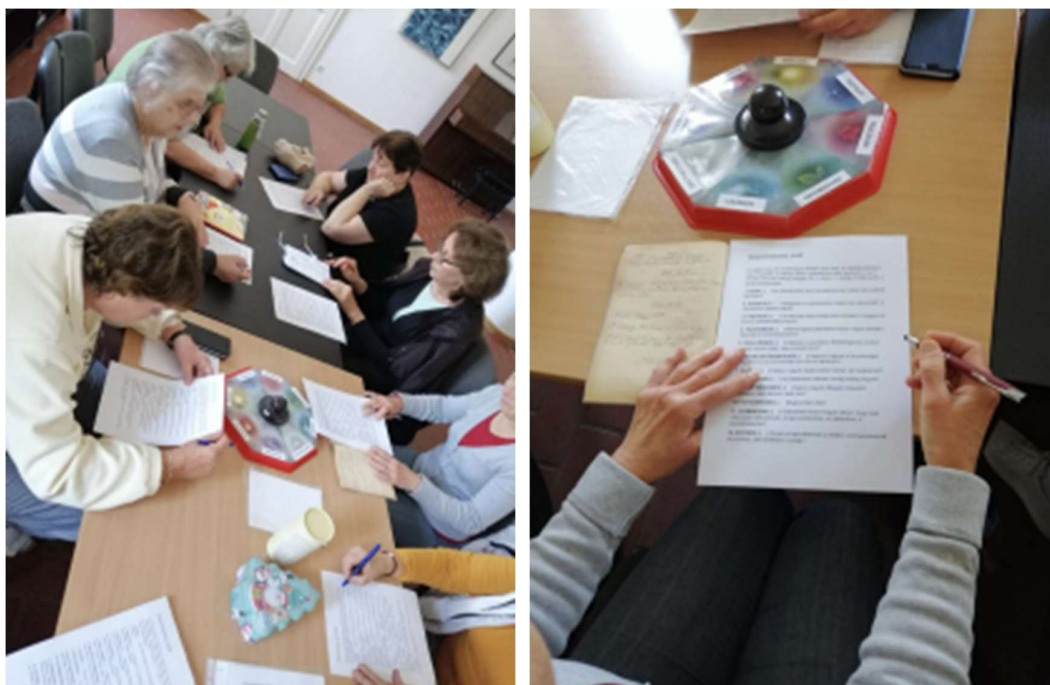
Filling in the quiz about values , Community Centre Érd

Community Centre ÉRD , workshops for elderly people, were held once a month. They studied values for WVD; especially peace, love, self-respect and responsibility. After all these workshops they finished with a quiz, where they could give answers for questions about the 12 values which are the basis of LVE. By the questions they got a chance to learn more about themselves. Every meeting gave everyone many new insights and recognitions.