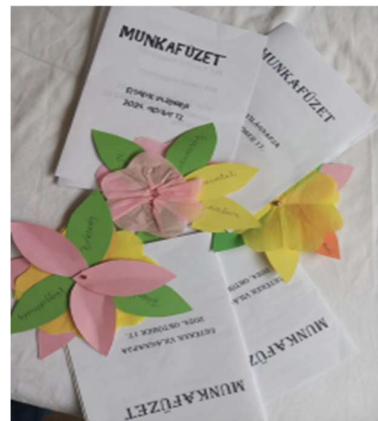
'Creative Thoughts' workbook 'Mapping their own values' at Creative Thoughts Club, Komló