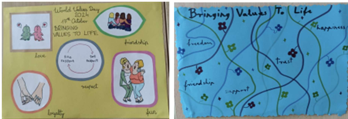
'Values' mini posters - Kando Primary School, class 8

The parents appreciated the teacher's initiative very much, to help children to spend their time with such useful tasks.