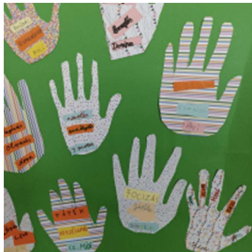
'Extend your Hand' - Kando Primary School, class 4